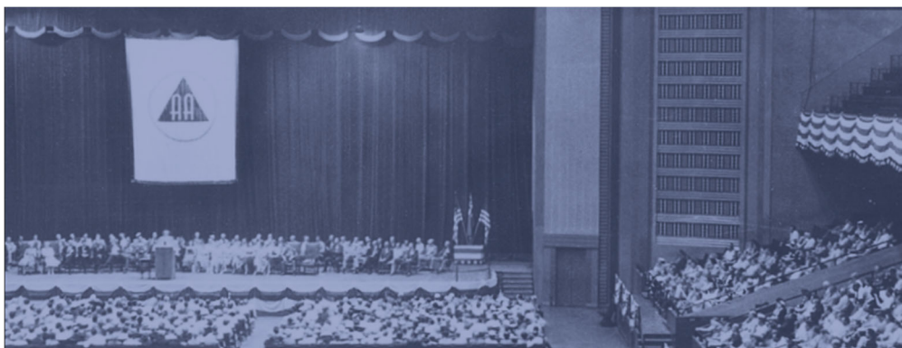
A.A. International Convention. St. Louis, MO 1955

from across the country to visit our General Service Office and examine the services it provided and the funding which supported it. Bill's "A.A.'s Legacy of Service" can be found in Appendix A of The A.A. Service manual and is a great brief record of A.A.'s history from its beginning to 1951.